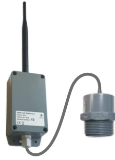
SU11 - 6/4" ULTRASONIC LEVEL SENSOR